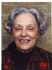
Dorothy St. Germain Team Leader Fellowship