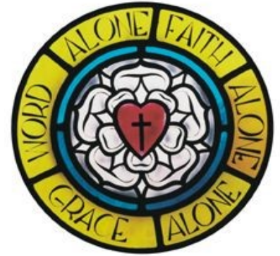
THE LUTHER ROSE

Do not worry about anything, but in everything by prayer and supplication with thanksgiving let your requests be made known to God. And the peace of God, which surpasses all understanding, will guard your hearts and your minds in Christ Jesus. Philippians 4:6-7