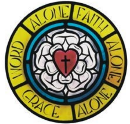
The Luther Rose